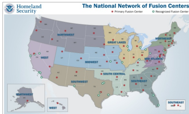
Figure 2: Intelligence and Information Sharing As of February 2012, the National Network of Fusion Centers includes 77 locations.