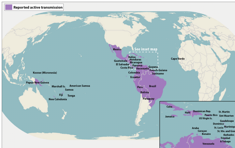
Figure 1. Zika virus spread worldwide and in the Americas . Centers for Disease Control and Prevention, May 9, 2016.