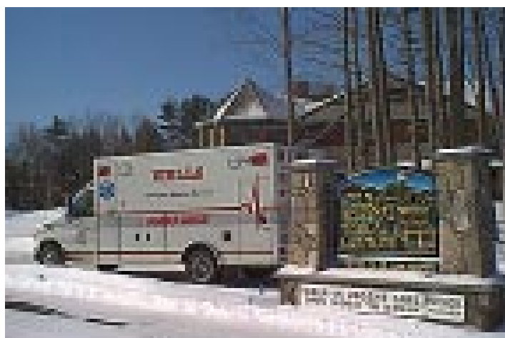
Rural EMS providers, like this one in Wells, Maine, face severe challenges in training and reimbursement.