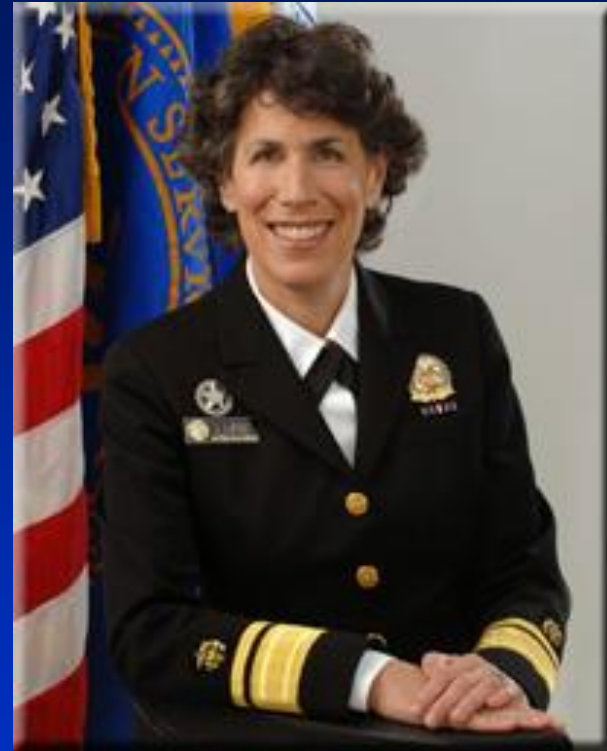
Nicole Lurie, M.D., M.S.P.H. Assistant Secretary for Preparedness and Response RADM, U.S. Public Health Service U.S. Department of Health and Human Services