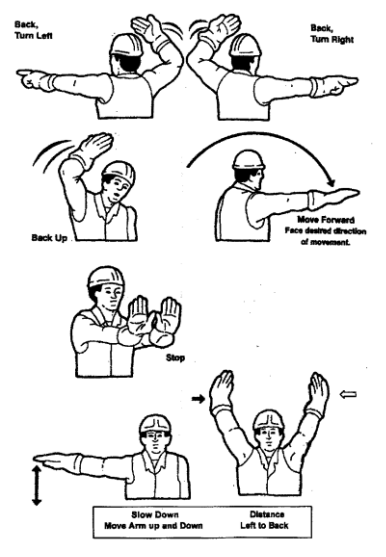
Figure 1. Typical Hand Signals

(From Alton Fire and Rescue Department Standard Operating Guidelines <u>http://www.altonfire.org/SOG_1.3.4_Backing-Up_Apparatus.pdf</u>)